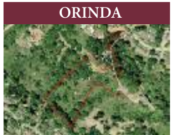
46 Cedar Terrace Excellent 3.93 acre property located at the end of Cedar Terrace, off of Cedar Lane. Views and Privacy! Build a Dream Estate!